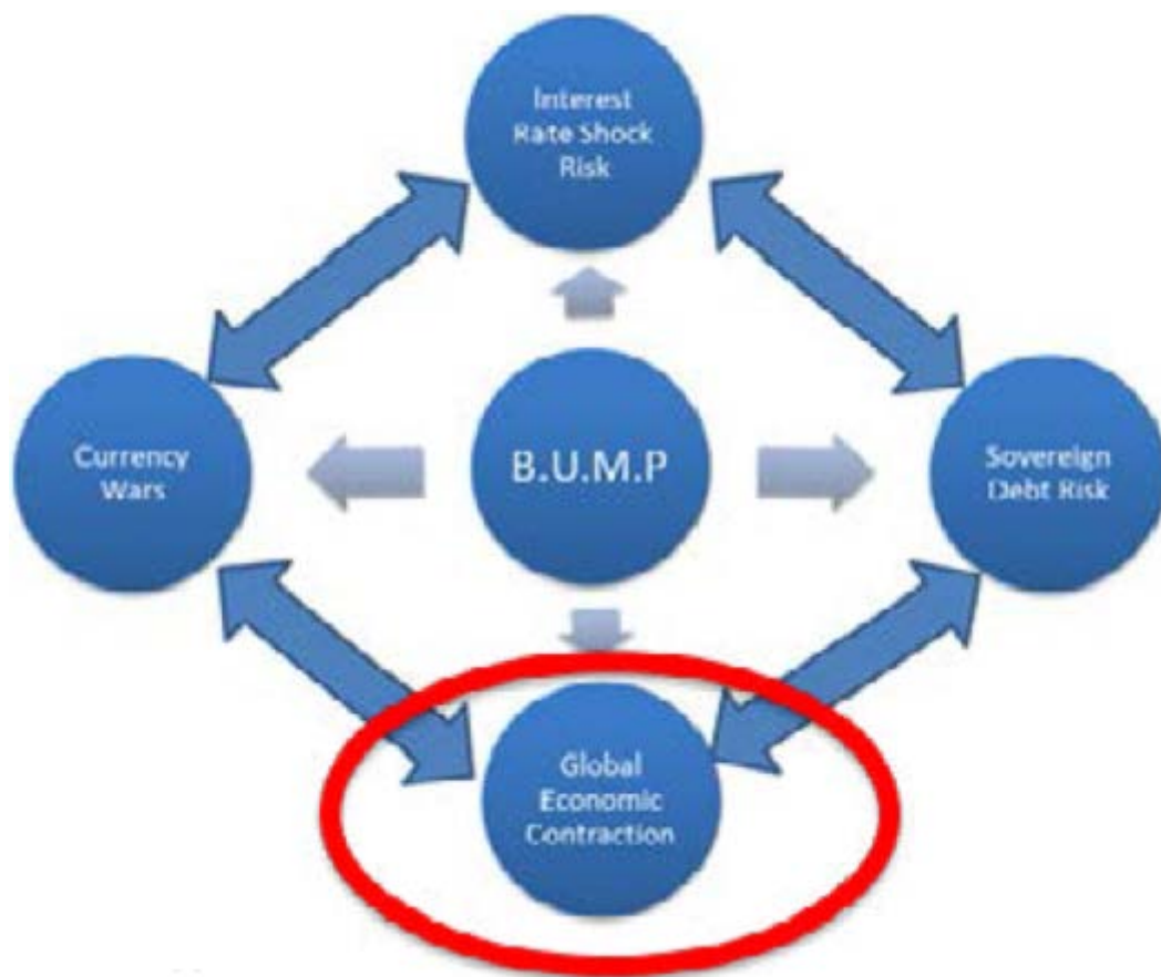
Figure 1: B.U.M.P and Global Economic Contraction

This week's Global WRAP takes a more in depth look at the detail of B.U.M.P and its direct impact on the global economy with specific reference to the threat of deflation. This week's focus is therefore again on B.U.M.P and the satellite node of Global Economic Contraction.