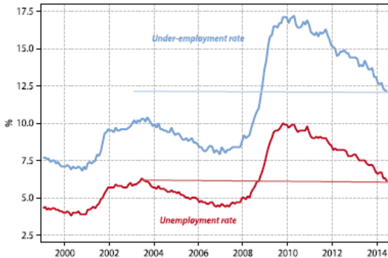
Figure 1: US unemployment and "underemployment"

In the UK, the standard indicators of excess capacity are even more striking. Unemployment at 6.5% is 1.5ppts above where it was in 2003 when the BoE was still easing, while manufacturing production (Figure 2) is still 9% below the level of 2007. Under these circumstances, fear of inflation would be the only standard argument for tighter money, but signs of accelerating inflation are almost entirely absent, at least for now.