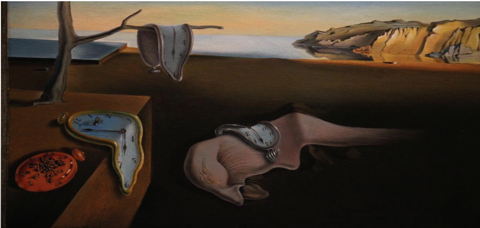
Photo taken at MOMA, New York

PortfolioConstruction Forum Summit 2017 ( PortfolioConstruction.com.au/Summit )